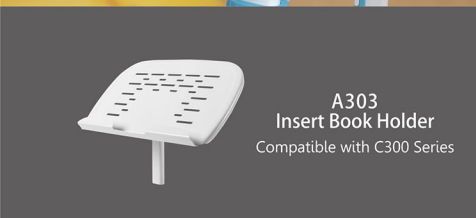
A303 Insert Book Holder Compatible with C300 Series