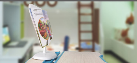
A304 Freestanding Book Holder Compatible with E500 Series