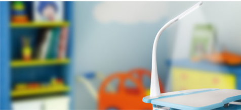
A306 LED Lamp Compatible with C300 Series